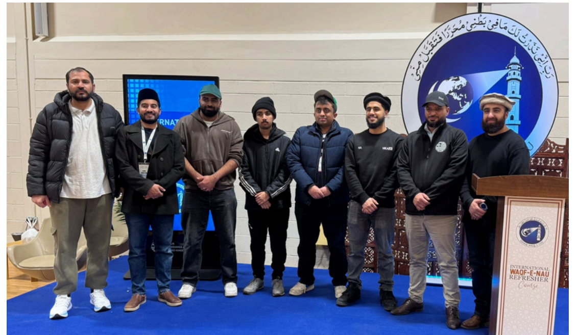
Waqar-e-Amal at Islamabad Masroor Hall.