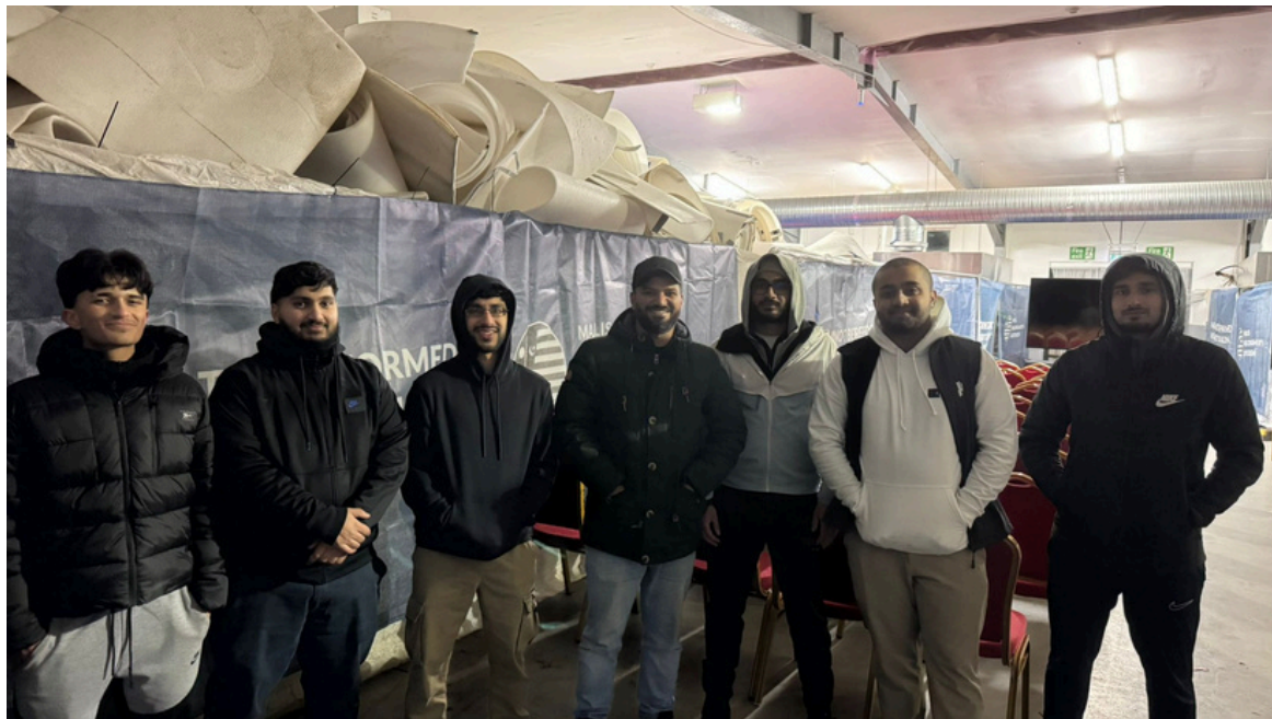
Waqar-e-Amal at Hadeeqatul Mahdi for Qaideen Camp.