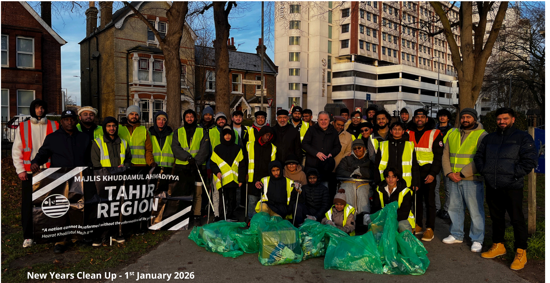
New Years Clean Up - 1 st January 2026