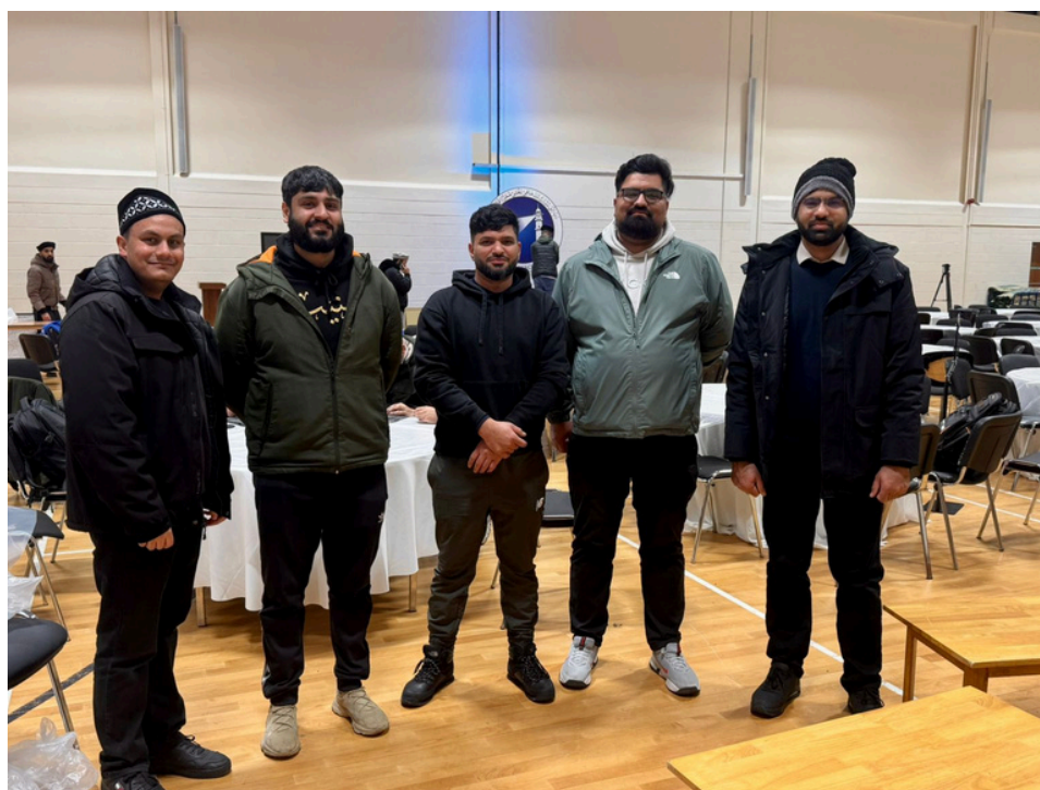
Waqar-e-Amal at Islamabad.