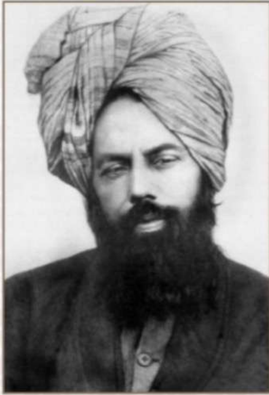
Hazrat Mirza Ghulam Ahmad AS - The Promised Messiah and Mahdi