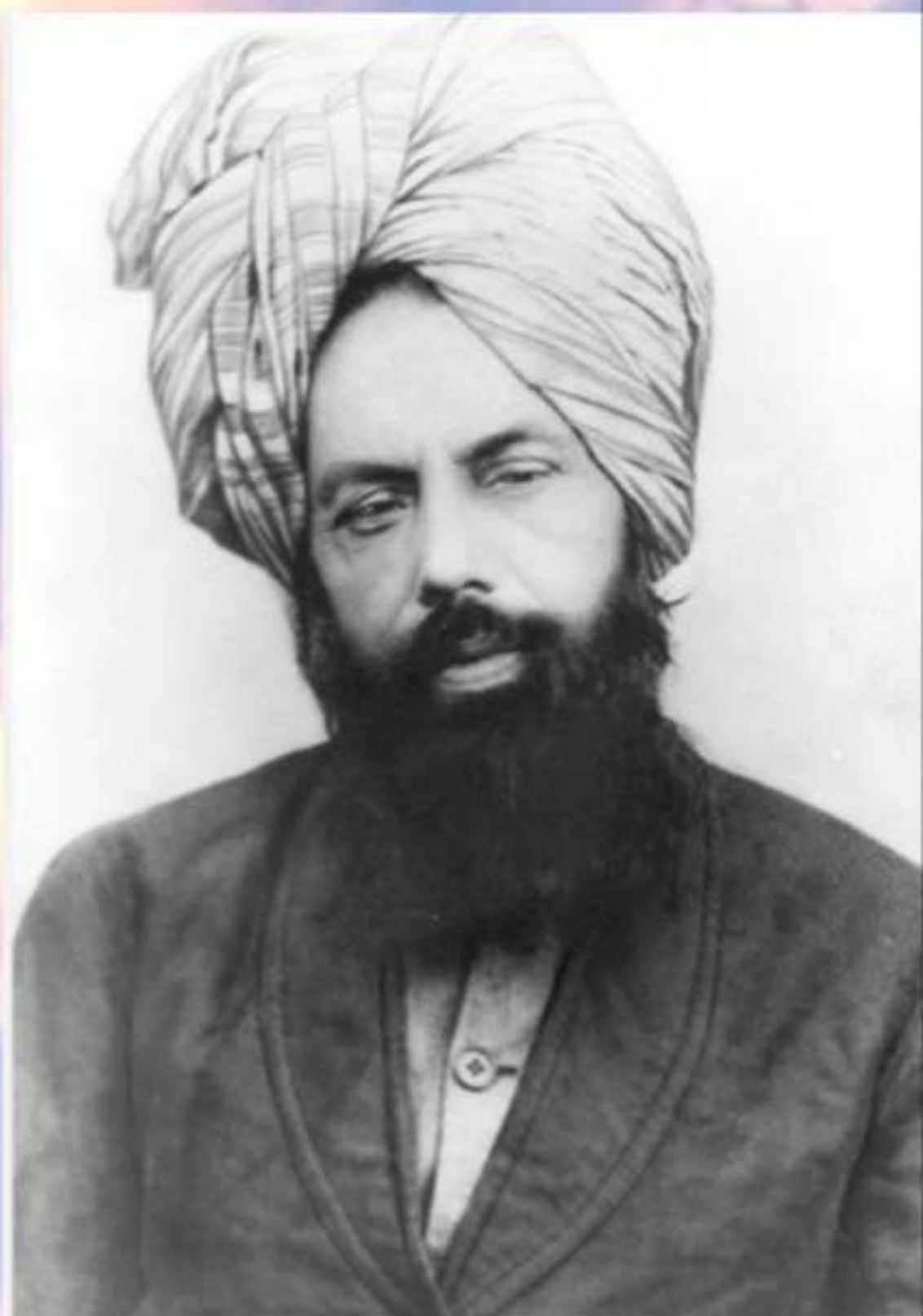
His Holiness Mirza Ghulam Ahmad (Peace Be Upon Him)